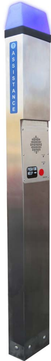
Shown with IP6000 (not included)