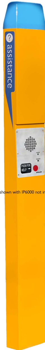
(shown with IP6000 not included)