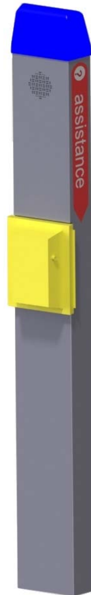
Shown with H305 door (not included)